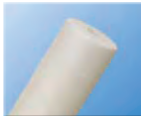
STAGE 1 5 MICRON SEDIMENT

*(The HALO ION is proven to dissolve existing scale, prevent new scale formations and inhibit corrosion)