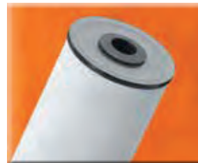
STAGE 2 ULTRA FLOW CARBON