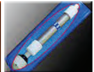
STAGE 3 HALO ION ELITE